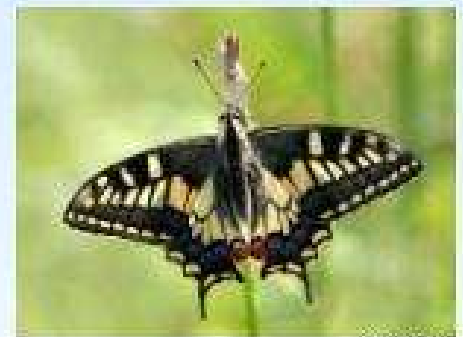
G. Bone il

Size: 35 – 46 mm Produces two broods and sometimes a third. Sub-species melitensis is endemic Occurrence: Feb. – Oct.