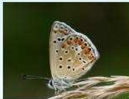
G. Bone il

Size: 12 – 18 mm Jerky, rapid flight distinguishes it from other blues. Occurrence: Feb. – Nov.